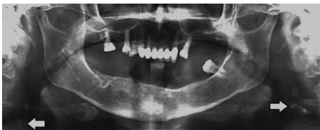
Figure 2 - Panoramic image showing multiple irregular radiopacities of the calcified carotid artery atheromas (arrows) on both right and the left side.